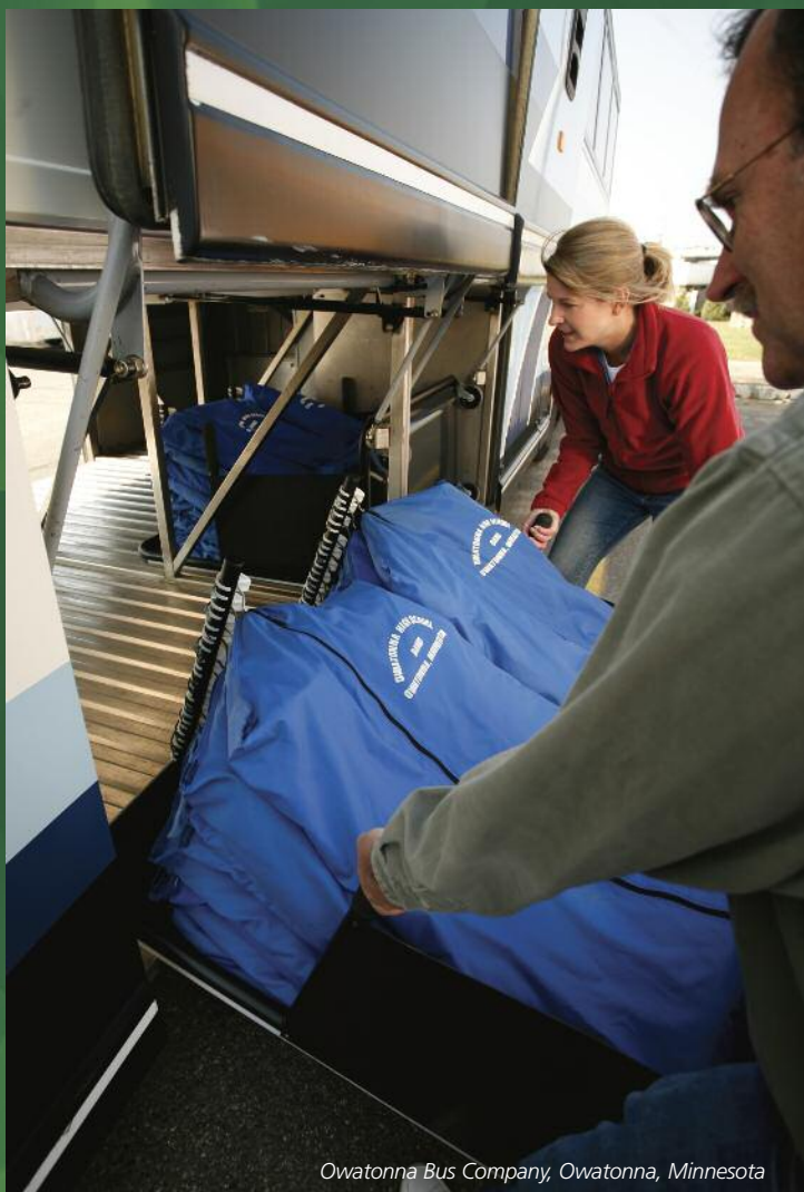
Owatonna Bus Company, Owatonna, Minnesota