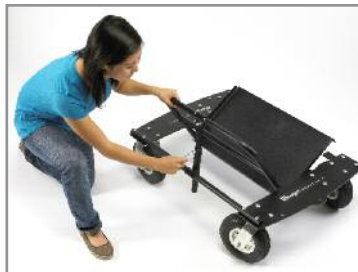
Adjusting the speaker angle is easy.