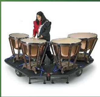
Timpani Cart Page 78

Rugged, built to last, with the ability to easily haul instruments, uniforms, etc. wherever you need them.