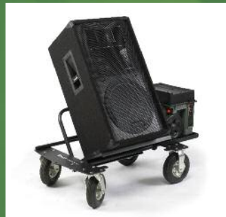
Speaker Cart Page 81

Holds and stores large bass drums or gongs. Great for marching band competitions or concerts.