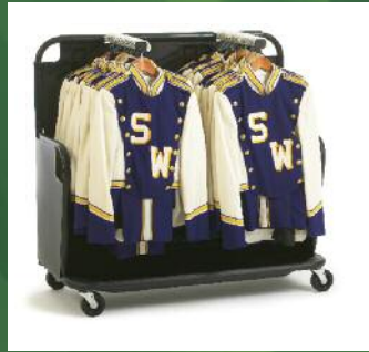
Uniform Cart Page 76

The safe, secure, easy way to transport marching band uniforms. Great for low-profile and under-bus storage.