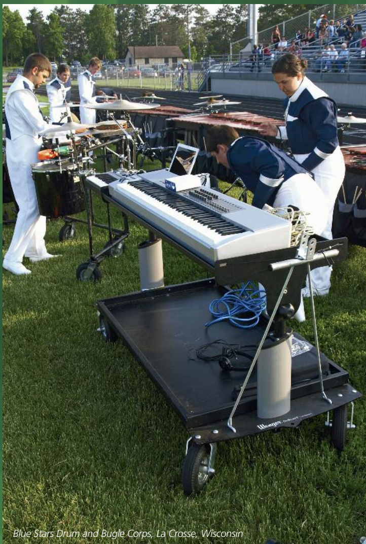
Blue Stars Drum and Bugle Corps, La Crosse, Wisconsin