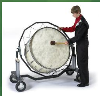
Bass Drum/Gong Cart Page 80

Marching bands and drum corps will love the storage, mobility, and easy access for outdoor performances. Works great for indoor rehearsals too.