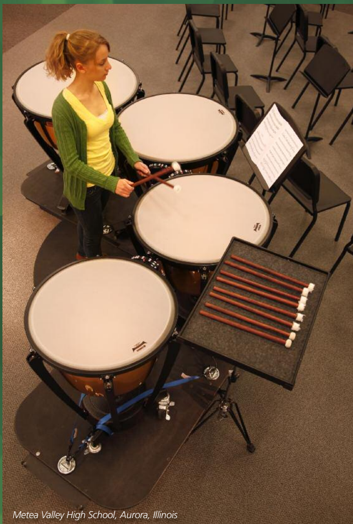
Metea Valley High School, Aurora, Illinois