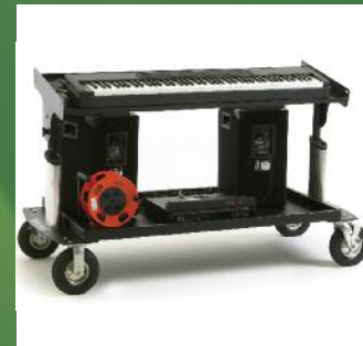
Keyboard Cart Page 81

Heavy-duty workhorse stores and moves large speakers down the hall or across the football field.