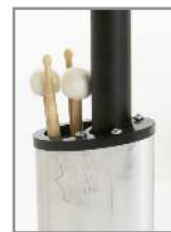
Handy storage for mallets and sticks.