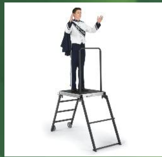
Auxiliary Podium Page 79

Transports individual drums or timpani sets. Perfect for concert or field use.