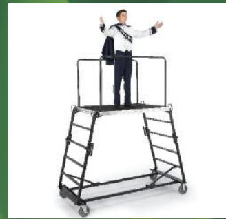
Field Podium Page 79

Compact, folding design rolls easily on two wheels when folded and then sets up fast where you need it.