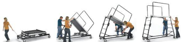
The Field Podium can set up easily in three simple steps with two people.

210A018 OnBoard Field Podium, 263 lbs (119 kg)