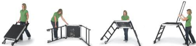
The Auxiliary Podium can set up easily in three simple steps by one person.

210A019 OnBoard Auxiliary Podium, 81 lbs (37 kg)