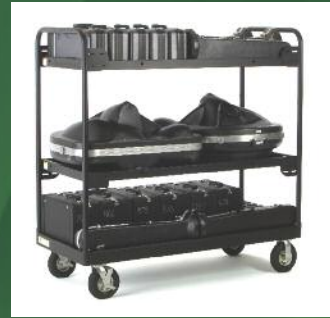
Cargo Cart Page 77

The safe, secure, easy way to transport marching band uniforms. Great for low-profile and under-bus storage.