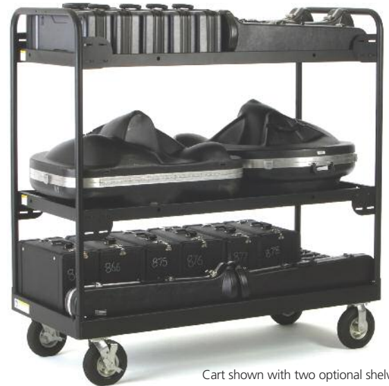
Cart shown with two optional shelves.

– Evelio Villarreal, Director of Bands Plano East Senior High, Plano, Texas