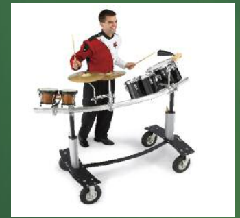
Percussion Cart Page 80

A revolutionary new design for drum majors makes setup a snap in under 30 seconds.