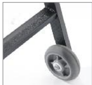
Rubber wheels make rolling this podium onto the field a snap.