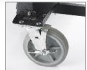
Large diameter rubber wheels with brakes