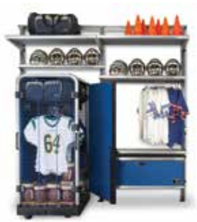
(shown with GearBoss SportCart)