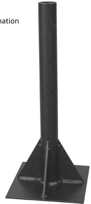
Mule Block Swivel Stand 5C2-850S