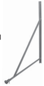
Outrigger Bracket 015-96