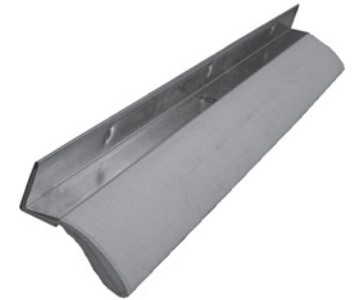
Smoke Seal Assembly 016-SEAL4