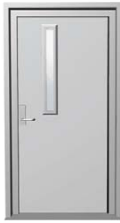
Accent Window (STC 50)