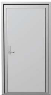
Solid (STC 50)

So whether you're building, renovating, adding on or replacing doors that don't work, the Wenger Acoustical Door is your solution to sound isolation.