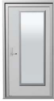
Full Window (STC 51)