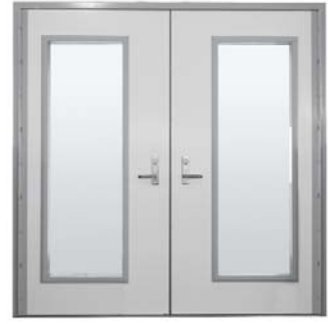
6' (183cm) Double Door (STC 49)