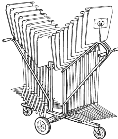
Large Move and Store Cart