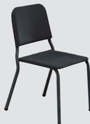
Student Music Posture Chair (0930000) Wenger Corporation