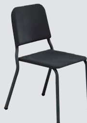
Student Music Posture Chair (0930000) Wenger Corporation