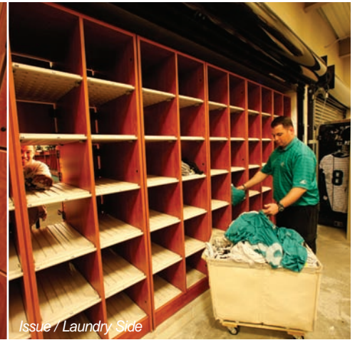
Athlete Side Issue / Laundry Side

Wenger custom casework solutions bring a higher level of function and aesthetics to athletic spaces. From lockers to pass-through laundry cubbies, Wenger will customize casework to enhance your designs. All of our solutions begin with high-quality standards including our patented polyethylene shelves designed to provide an easy-to-clean surface and to enhance air-flow. We use a polyester laminate which out-performs cheaper melamine solutions. Antimicrobial laminate options can add another line of defense against sanitation issues. Bolt-through construction means that doors and connection points will never pull out and replacement doesn't require breaking apart glue and dowel construction.