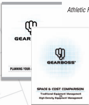
Athletic Facility Planning Guide

The Space & Cost comparison shows you how GearBoss stacks up against traditional storage rooms to save money and square footage while improving all aspects of athletic equipment storage.