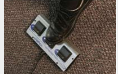
Optional foot-switch provides hands-free record and playback control from anywhere in the room.