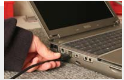
USB connection makes it easy to upload accompaniments or download practice sessions.