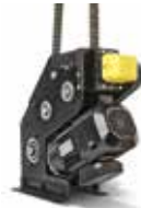
Stage Engineering & Rigging