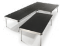
Staging & Platforms