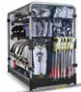
High-Density Storage Carts