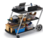
Mobile Storage Carts