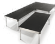
Staging & Platforms