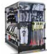
High-Density Storage Carts