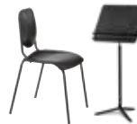
Music Chairs & Stands