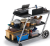
Mobile Storage Carts