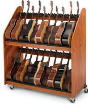
Shown with 20 acoustic guitars.