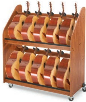
Shown with 10 guitarrons.