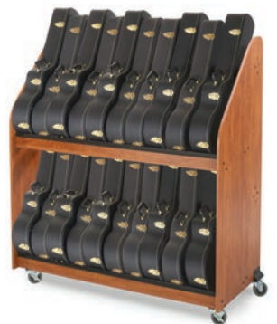
Shown with 20 acoustic guitar cases.