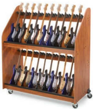
Shown with 20 electric guitars.