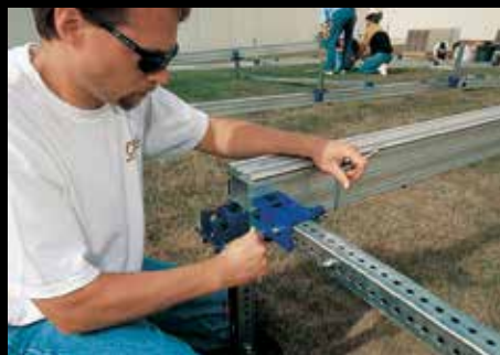
STRATA uses pins to eliminate the time-consuming nuts and bolts typical of other flooring systems.