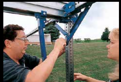
STRATA has self storing diagonal bracing that provides lateral stability and does not require any tools. STRATA'S diagonal bracing is all you need for floors up to 4 feet (122 cm) high.