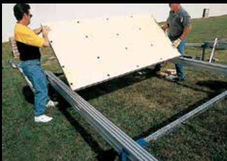
A small crew can set up the lightweight STRATA System in just hours