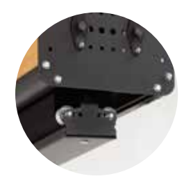
Built-in adjustable spacing between fabric layers for fine tuning absorption

Finished laminated wood end enclosures in a variety of finishes.