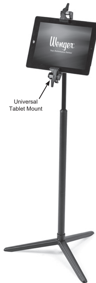
Universal Tablet Mount (shown on traditional music stand)