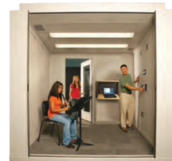
The correct amount of absorption and diffusion is built-in so the musician can clearly hear the best possible sound.