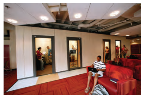
Schools like the University of Boston have installed SoundLok rooms of various sizes to accommodate their growing music program. Many rooms have VAE technology installed.

GREENGUARD Like many Wenger products, SoundLok rooms are GREENGUARD certified to protect indoor air quality.