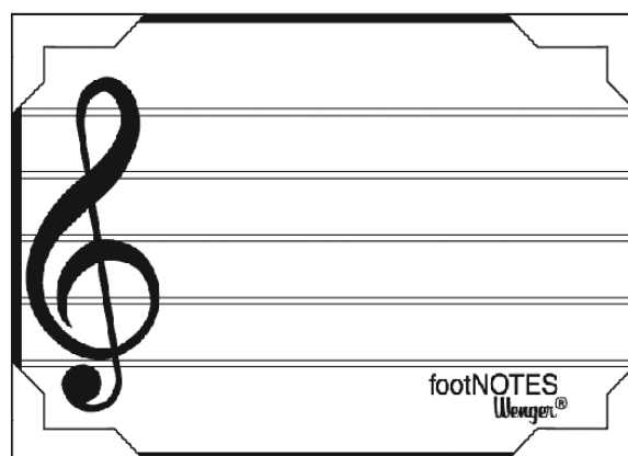
Rectangular footNOTES Rug