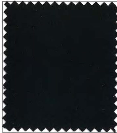
ENCORE™ 15 oz. / 62" WIDE BLACK