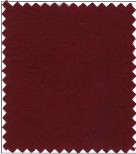
ENCORE™ 22 oz. / 64" WIDE CABERNET