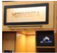
ACRYLIC DOOR PANELS AND LCD SCREEN READY