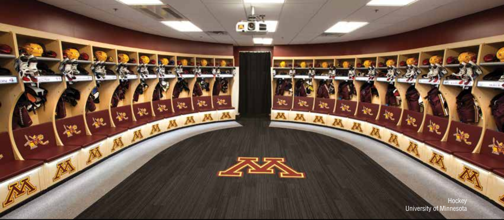
Hockey University of Minnesota