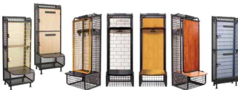
Wood Door, Open, Grille Door and Double Tier Configurations

A space saving locker design that keeps your gear more sanitary. Designed with integrated benches, AirPro lockers free up valuable real estate, creating extra floor space and a more open feel. Plus, AirPro's durable metal grid construction allows for maximum airflow and minimum hassle. They're easy to clean and laminated surfaces are more sanitary with treated antimicrobial nano-silver technology that will last the life of the product. With new AirPro lockers, your team room problems are solved.