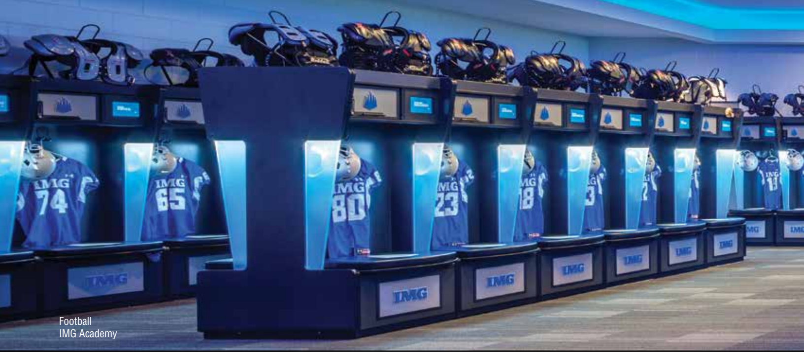
Football IMG Academy