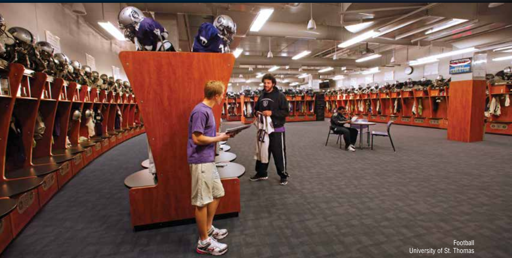
Football University of St. Thomas