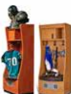
Elite™ Wood Lockers