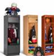
Rival™ Wood Lockers