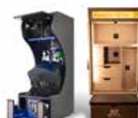
Custom Wood Lockers