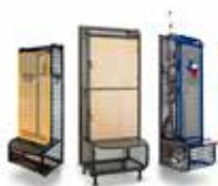
AirPro® Metal Grid Lockers