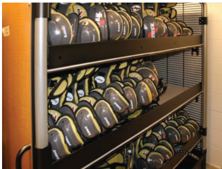
HIGH DENSITY STORAGE