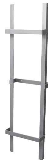
Lattice Track 012-5049R