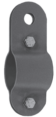
Full Pipe Clamp 026-22X1.5