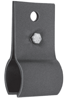
Half Pipe Clamp 026-21X1.5