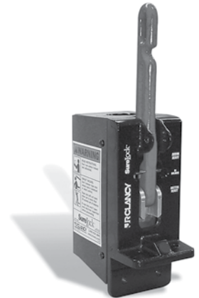
SureLock 010-600R US Patent 7,165,295

Rope locks are not designed to hold an imbalance of more than 50 lb (22.6 kg), nor to be used as a speed control.