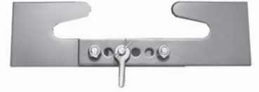
Beam Clamp 015-798