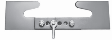
Beam Clamp 015-798