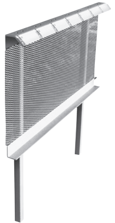
Gallery Mounted Locking Rail 011-558R6