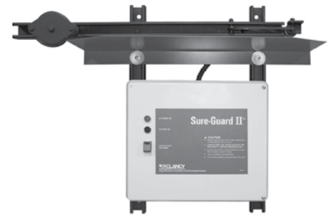
SureGuard II Release System 016-970