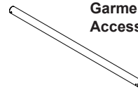
Garment Bar Accessory