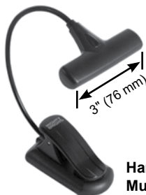
Hammerhead LED Music Stand Light