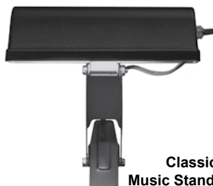
Classic Music Stand Light