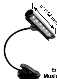
Encore LED Music Stand Light