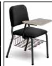
Folding Tablet Arm and Book/Music Storage Rack