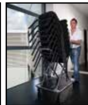
Move & Store Cart