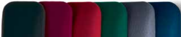
Black, Plum, Red, Green, Grey, Blue

Wenger Musician Chairs are available in six attractive upholstery colors, which are also perfect complements to Bravo Music Stands. Fabric samples available upon request.