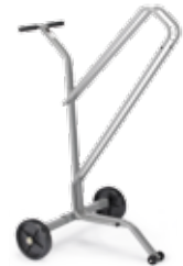
Small Music Stand Move & Store Cart will hold up to 12 Preface Stands.