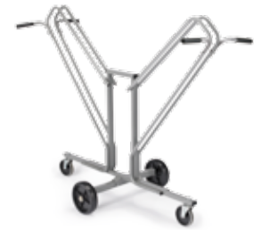
Large Music Stand Move & Store Cart will hold up to 24 Preface Stands.