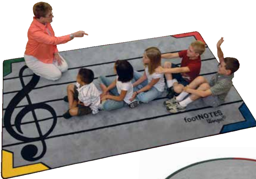
A creative way to introduce notation to younger students