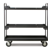
ONBOARD® CARGO CART