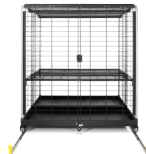
GEARBOSS® II STORAGE