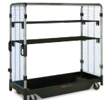
GEARBOSS® TEAM CART™