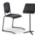
Music Chairs & Stands