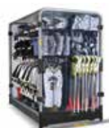
High-Density Storage Carts