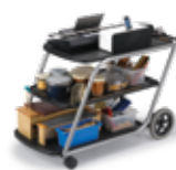
Mobile Storage Carts