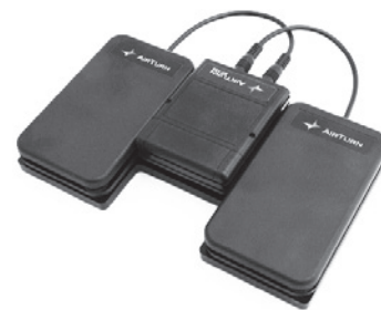
Hands-Free Page Turner