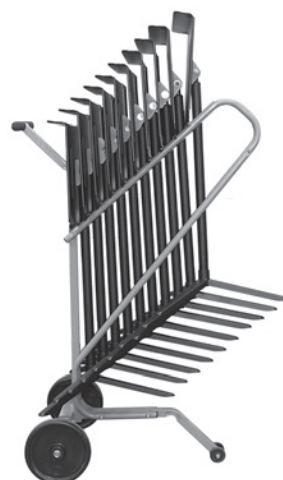
Small Move and Store Cart