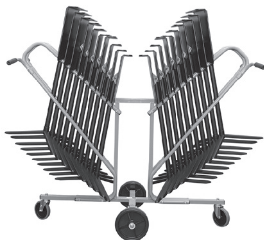
Large Move and Store Cart