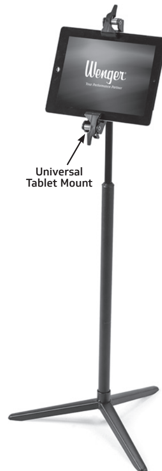
Universal Tablet Mount