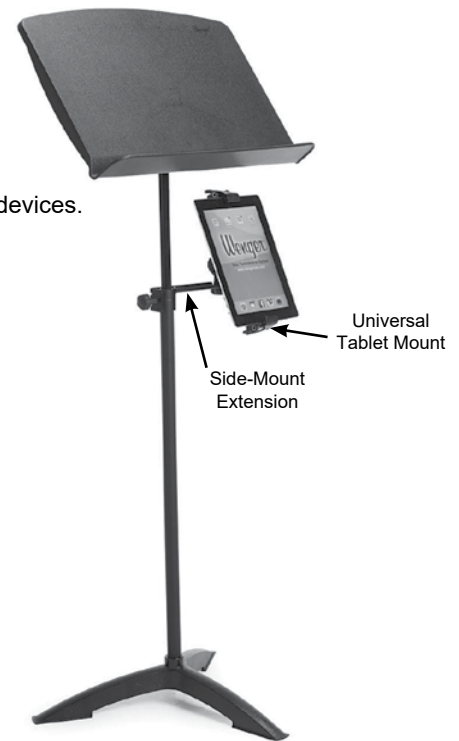
(shown on traditional music stand)