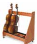
Conductor's Equipment • OnBoard Marching Band Products • Stage Platforms • Virtual Acoustic Technology • Workstations • Teaching Tools