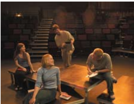
VERSALITE® STAGING PLATFORMS