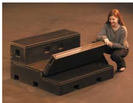
flipFORMS® REHEARSAL FURNITURE

“Wenger offers the most value and comfort for our budget.”