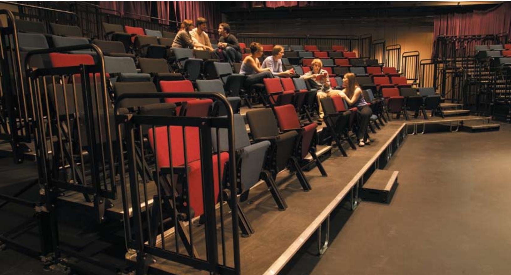
UPPER DECK AUDIENCE SEATING®