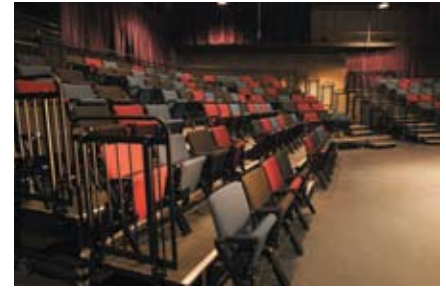
PORTABLE AUDIENCE CHAIRS