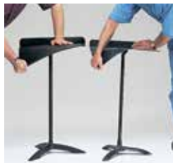
Classic 50 Metal Stand

We tested Classic 50 against metal to see which would bend — and stay bent.