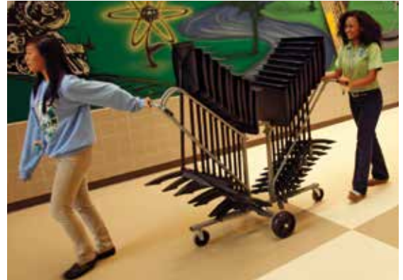
Move music stands from rehearsal room to performance area and back again with ease.