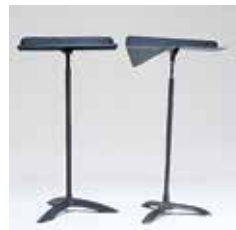
Classic 50 Metal Stand

We wanted to see how the Classic 50 and a metal stand would compare when subjected to identical sustained pressure.