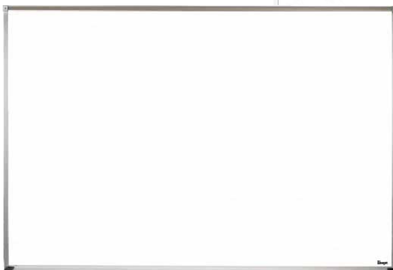
Porcelain Steel Markerboard