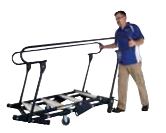
ARTICULATING STAIRWAY Variable-height stair units include removable safety and handrails treads. Available in 3-, 4-, 6- and 8-step models.