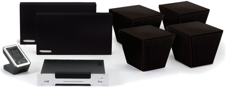
Studio VAE System