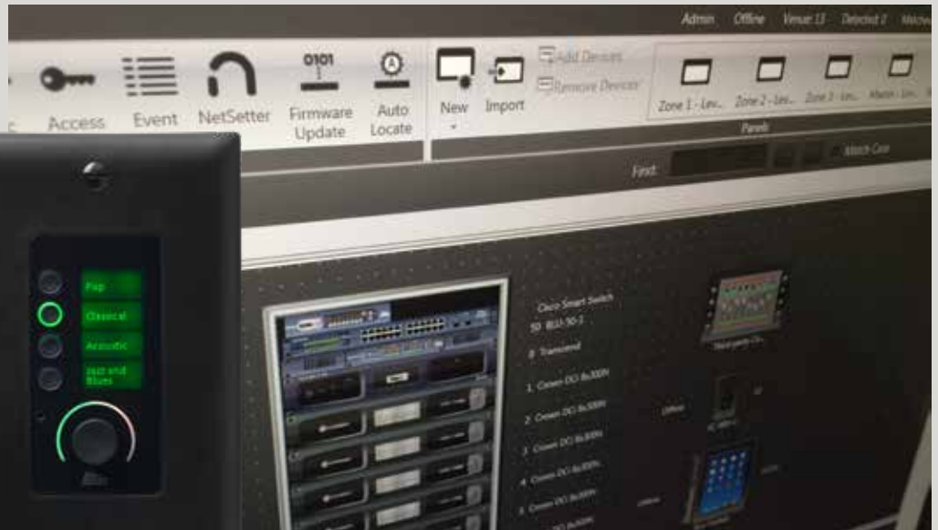
▲ Audio Architect