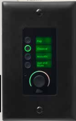
▲ Push Button Control