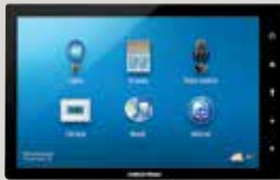
▲ Touch Screen Control

software allows the system to be monitored and adjusted from any laptop.