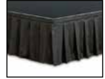
Skirting and Backdrop

Cover gaps between seated riser levels for a more finished look while keeping dust and litter from collecting under risers. Available in Band/Orchestra and Choral models.