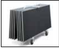
Move & Store Cart

Move and store as many as 12 Trouper decks at a time. Move & Store Carts move easily down the hall, around corners, and over thresholds. Available in 6, 8 and 12 unit models.