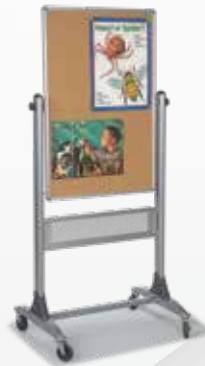
MOBILE PLATINUM REVERSIBLE BOARD