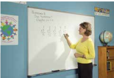
PORCELAIN STEEL MARKERBOARD