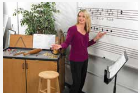
MUSIC NOTATION MARKERBOARD