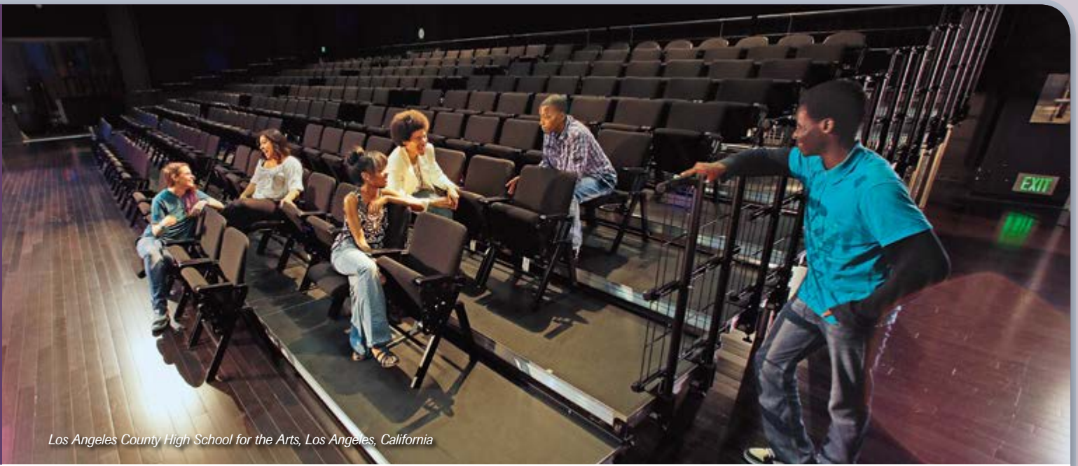
Los Angeles County High School for the Arts, Los Angeles, California