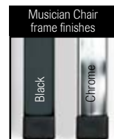
Musician Chair frame finishes