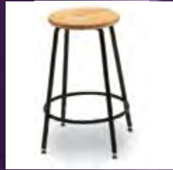
Ensemble Stool Page 18

Specifically designed for cellists, with posture, stability and comfort in mind.