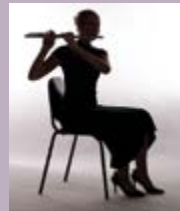
The Engaged Position (back)