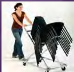
Chair Move and Store Cart Pages 15, 18

The benefits and comfort of our popular Nota® Chairs are now available in a commanding conductor's chair design.