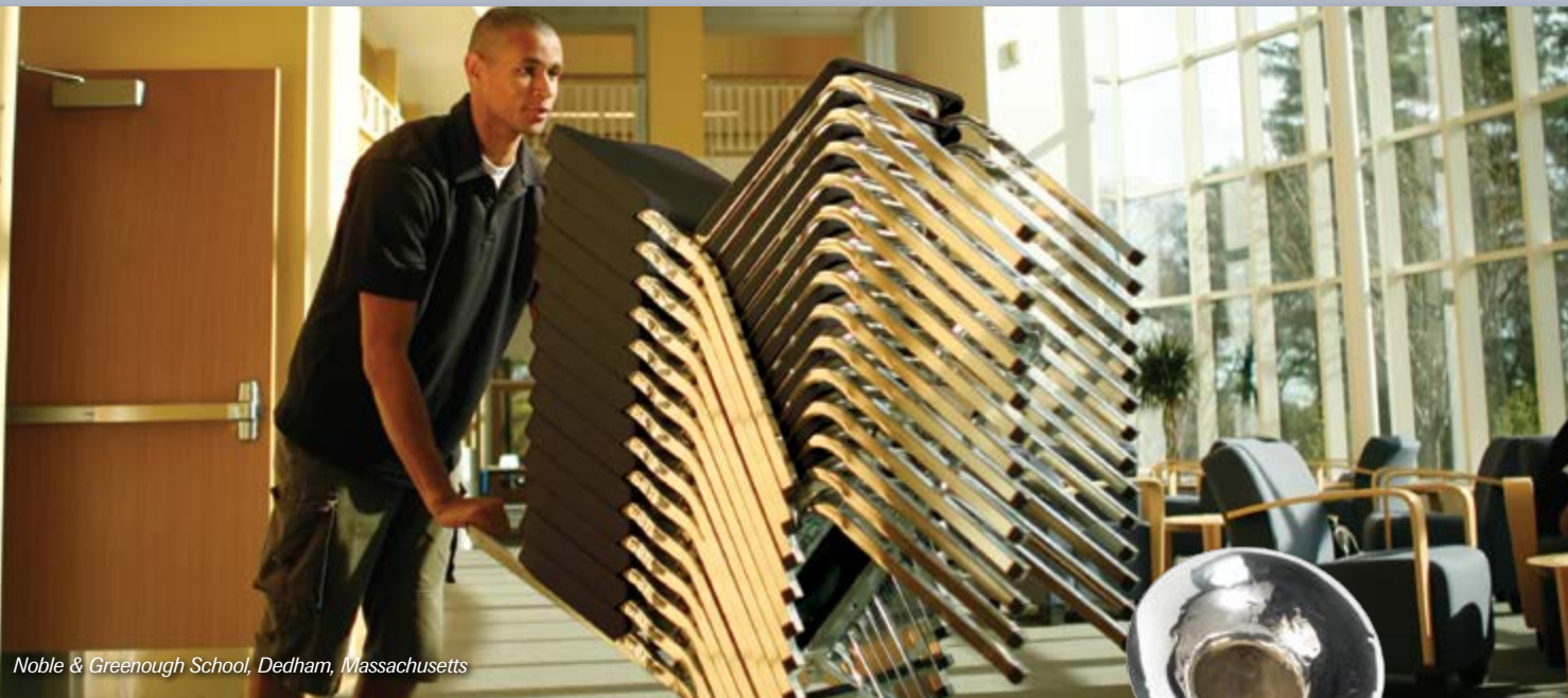
Noble & Greenough School, Dedham, Massachusetts