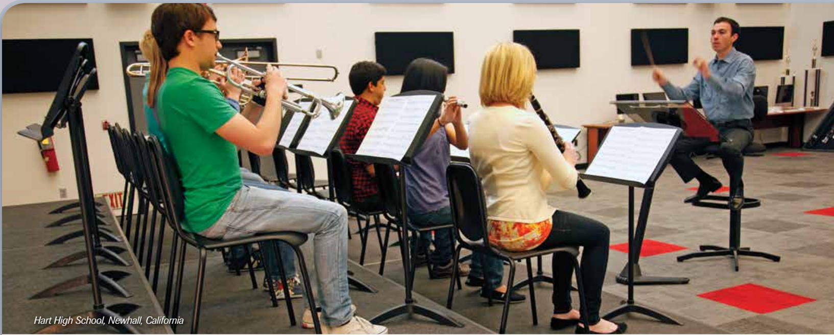
Hart High School, Newhall, California