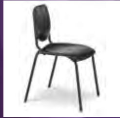
Nota® Standard and Premier Chairs Pages 10-11

Classic black styling meets proper posture. Designed for concert halls and top-tier programs.