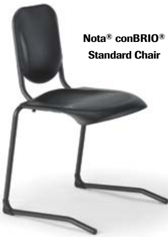
Nota ® conBRIO ® Standard Chair