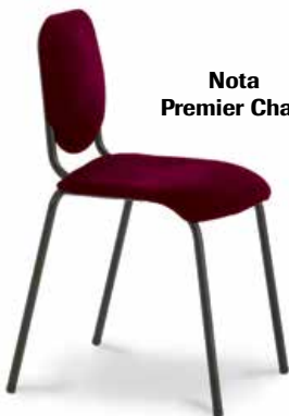
Nota Premier Chair

Wenger Music Posture Chair design redefined what a music chair should be by providing the seated musician with the same strong, natural posture as if they were standing. Nota takes that concept to the next level, providing rear and forward seating positions that allow musicians to sit in the manner that best suits their style and instrument. Both the Premier and Standard models also feature a narrow convex back that provides lumbar support while still allowing freedom and range of movement, and a rounded waterfall front that provides better circulation and comfort for a wider range of body sizes. Nota popularity is growing fast because there's no other chair like it and it's built to work and look great for the long run.