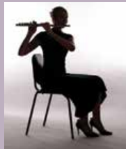
The Engaged Position (back)