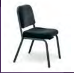
Symphony Chair Page 16

Classic black styling meets proper posture. Designed for concert halls and top-tier programs.