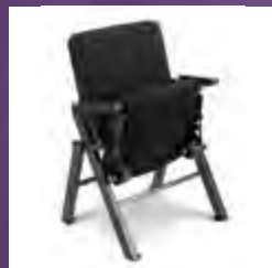
Portable Audience Chairs Pages 114

Roll your Music Posture Chairs wherever you need them, or store them safely away when you're done with them.