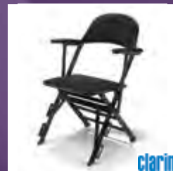
High-Density Portable Audience Chair by Clarin Page 114

A flexible alternative to fixed audience seating. Available in many widths and colors.