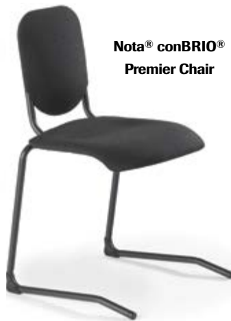
Nota ® conBRIO ® Premier Chair