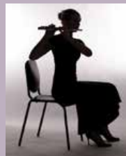
The Perched Position (forward)

No matter which position you or the conductor prefer, the Nota music posture chair is designed to keep your posture in the best possible place for performance and comfort.