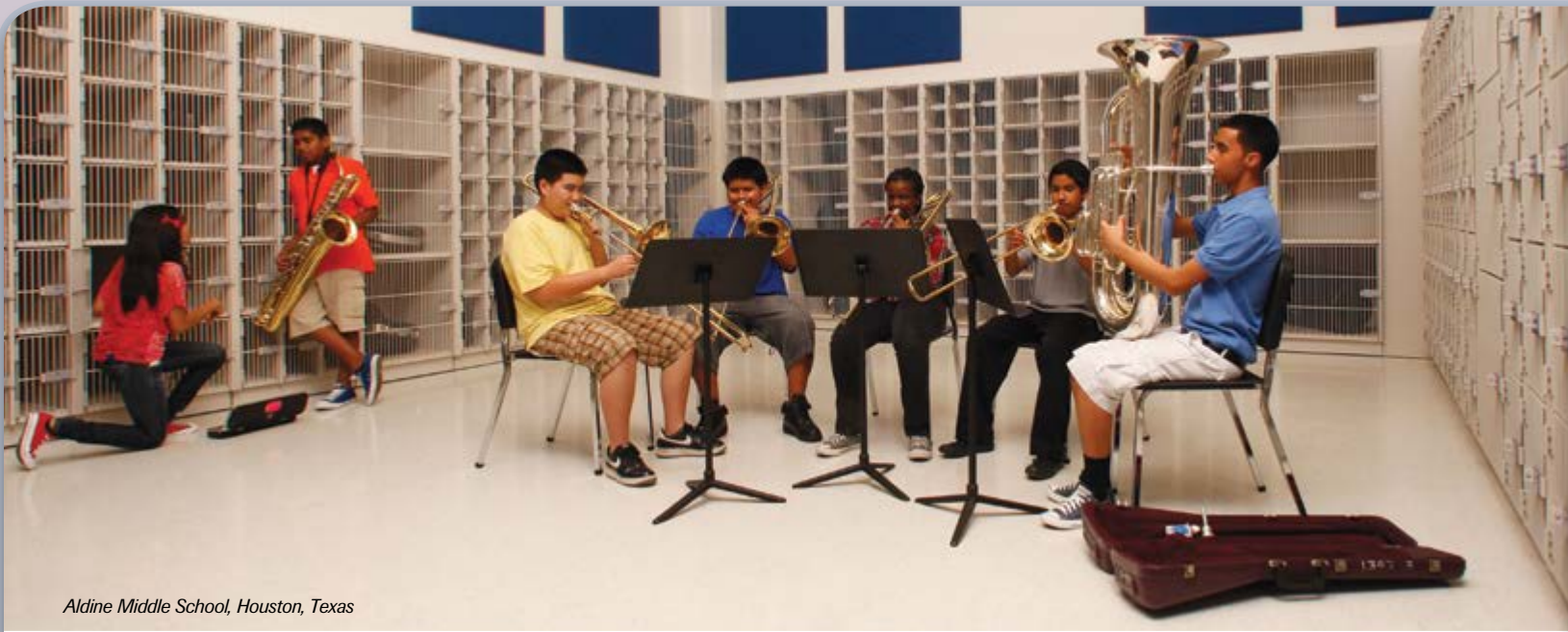
Aldine Middle School, Houston, Texas