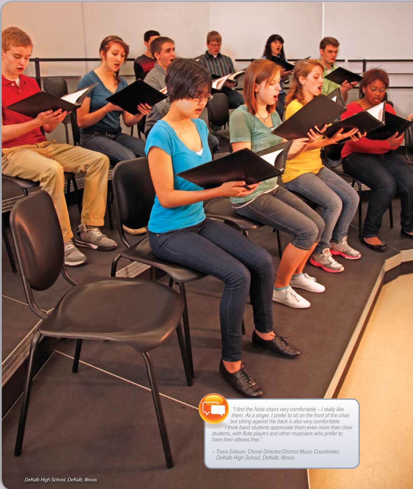
DeKalb High School, DeKalb, Illinois