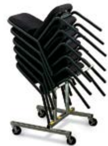
Move & Store Cart