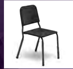
Student Chair Page 14

Posture chair design with extra padding for extra comfort.