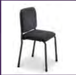
Cellist Chair Page 16

The original posture chair can be found just about everywhere. Promotes proper posture and breathing.