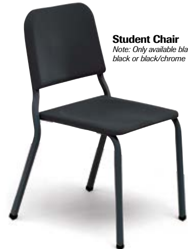
Student Chair Note: Only available black/ black or black/chrome