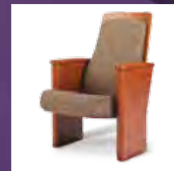
Fixed Audience Seating Page 19

Portable audience seating that's easy to fold and store.