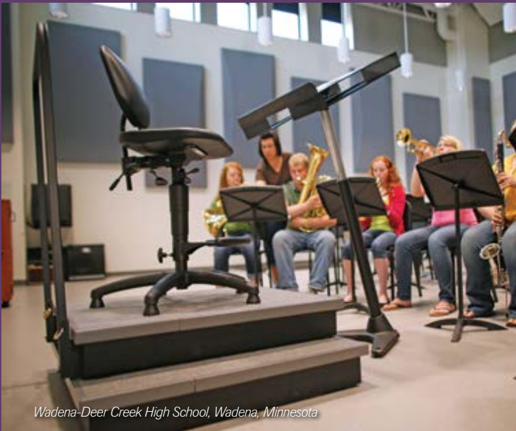
Wadena-Deer Creek High School, Wadena, Minnesota

Expert Consultation – Your Wenger representative can help you choose the chair that's right for your needs.