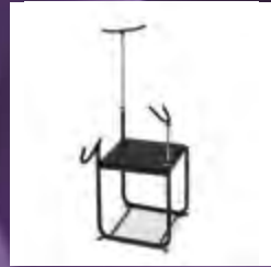
Sousaphone Chair Page 18

Always in demand, the Ensemble Stool features telescoping legs and a sealed natural wood seat.