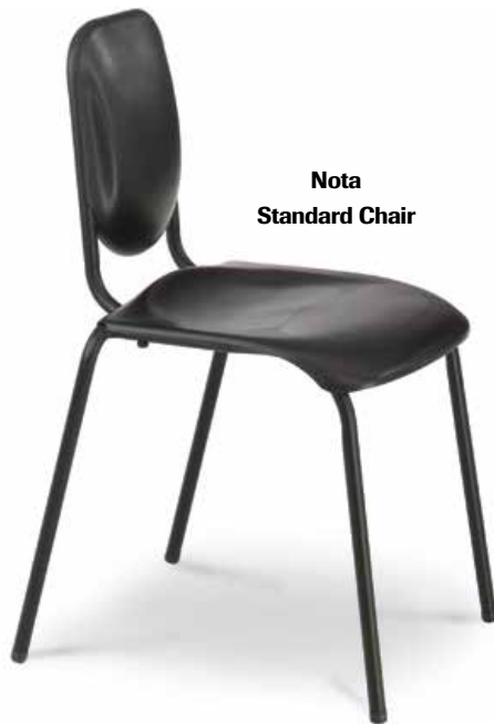
Nota Standard Chair

Options for Every Program and Environment – Available in a variety of colors, heights and finishes. A complete line of accessories are also available.