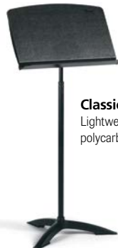
Classic 50® Lightweight with durable polycarbonate desk