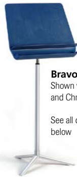
Bravo™ Shown with Blue desk and Chrome frame. See all color options below

All Wenger stands are GREENGUARD Certified by the GREENGUARD Environmental Institute (GEI)