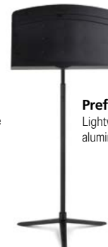
Preface® Lightweight with aluminum desk