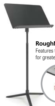
RoughNeck® Features trigger lock for greater weight capacity