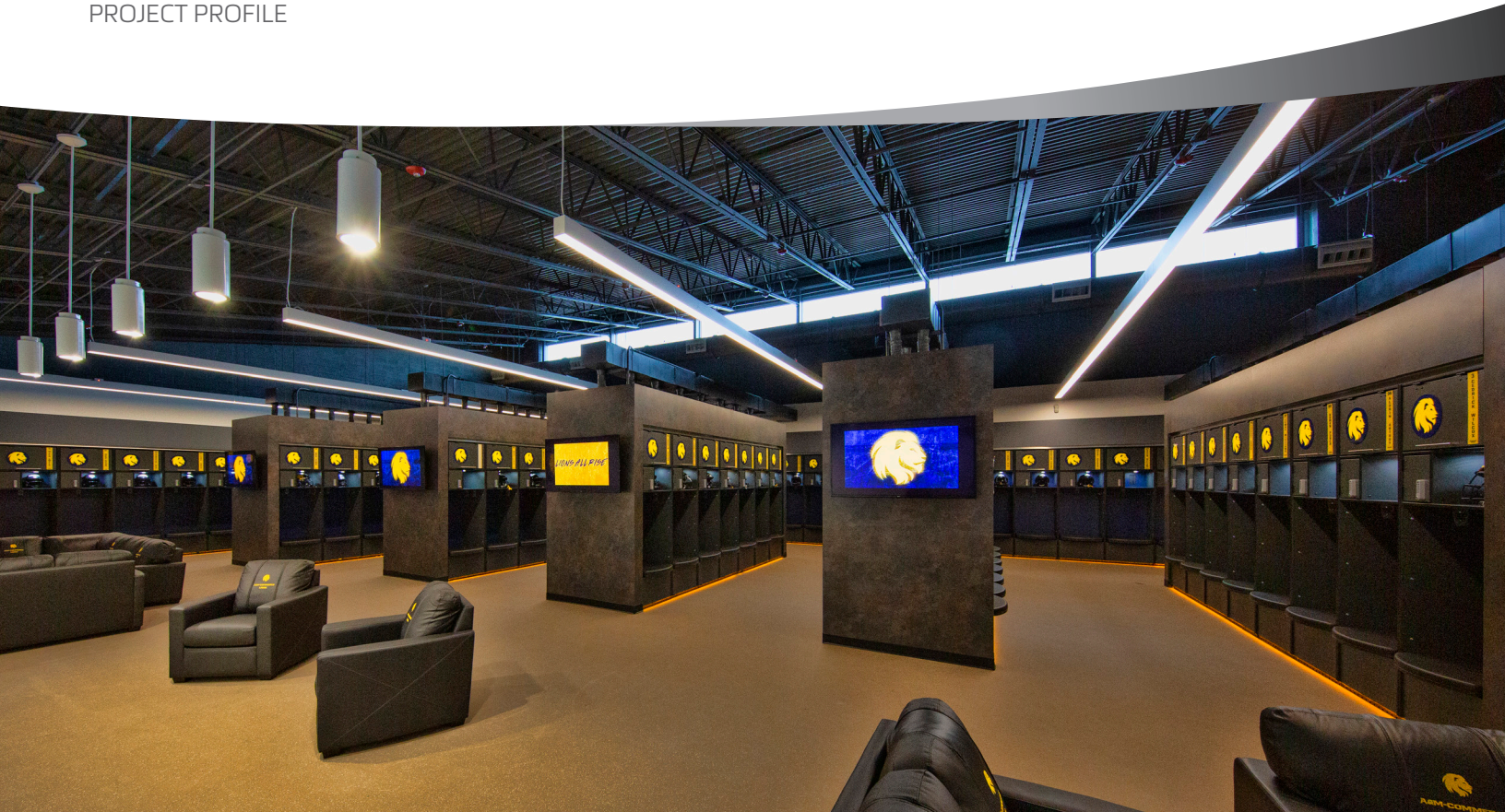
GEARBOSS® CUSTOM WOOD LOCKERS